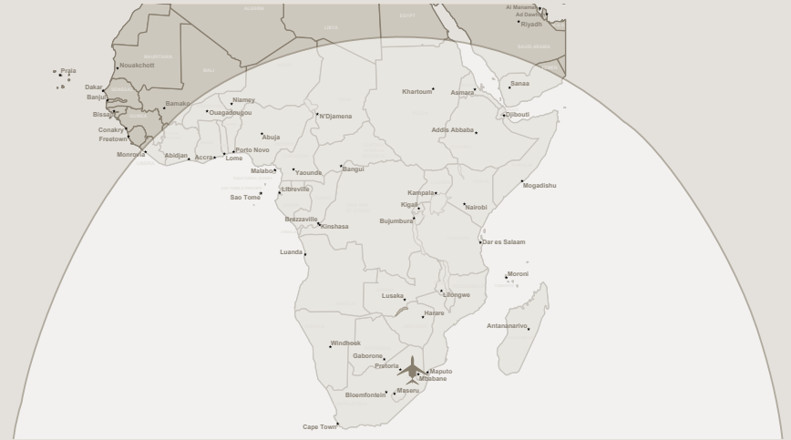
CHALLENGER 300 RANGE OUT OF LANSERIA

*based on average winds from doors shut to doors open